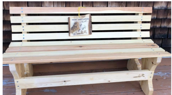
Bench donated by the Maine Cabin Masters.